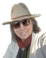
Contact me at pmccampfire.talks7@gmail.com